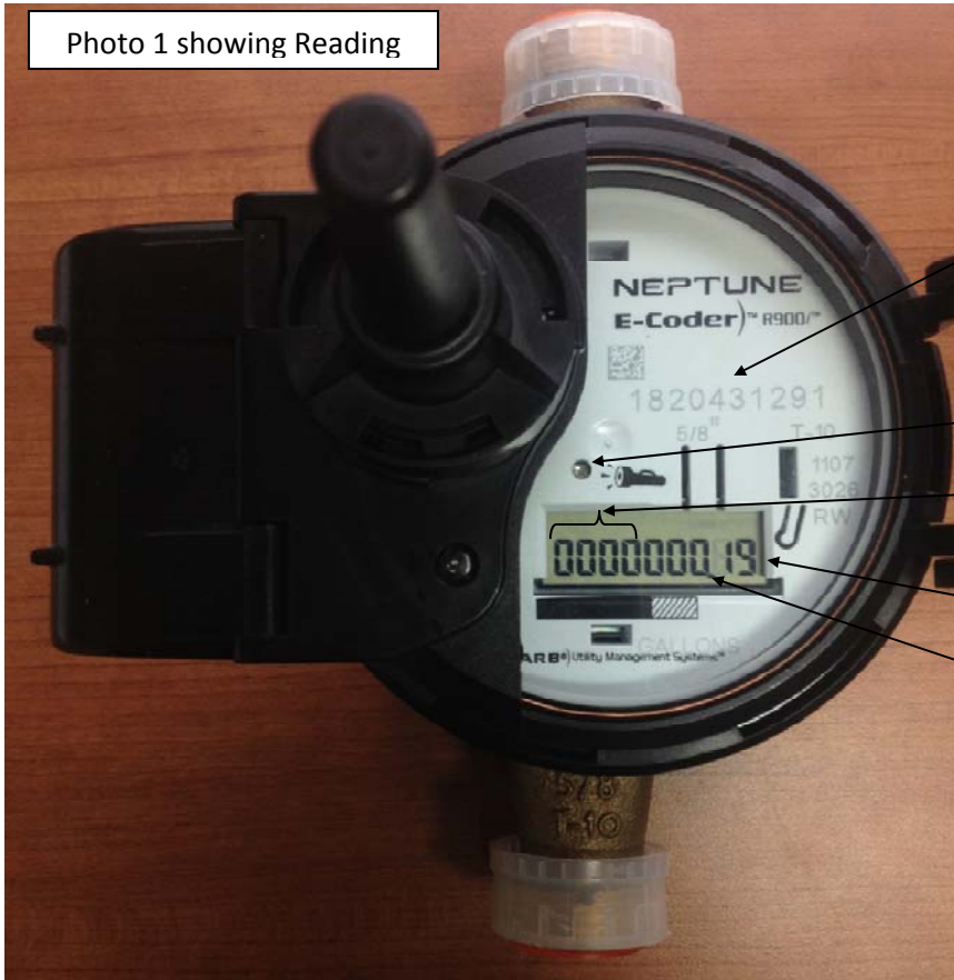
Photo 1 showing Reading